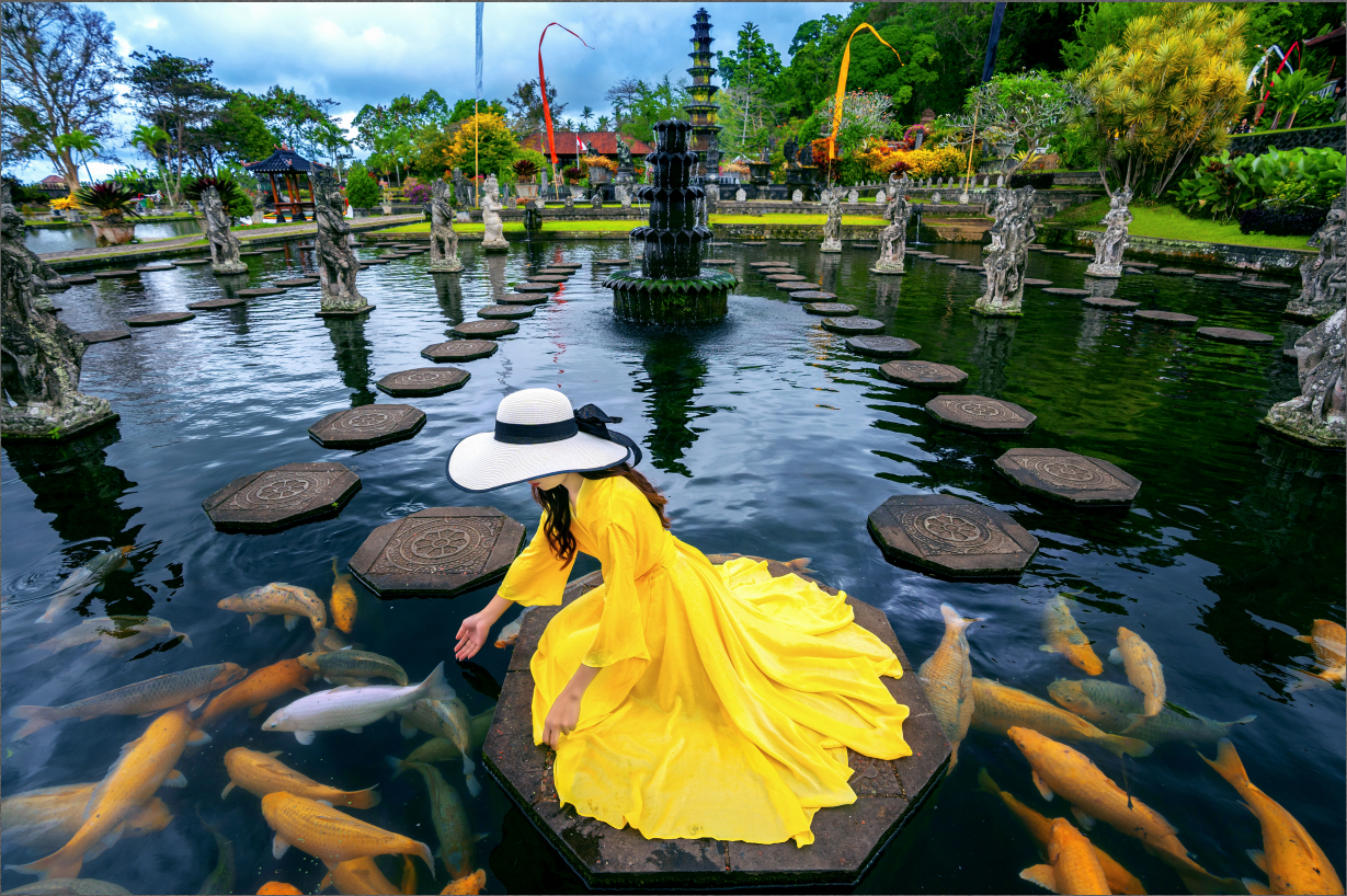
Above & Below: Tirta Gangga

Click to hear your Travel Designer discuss the merits and attractions of this program.