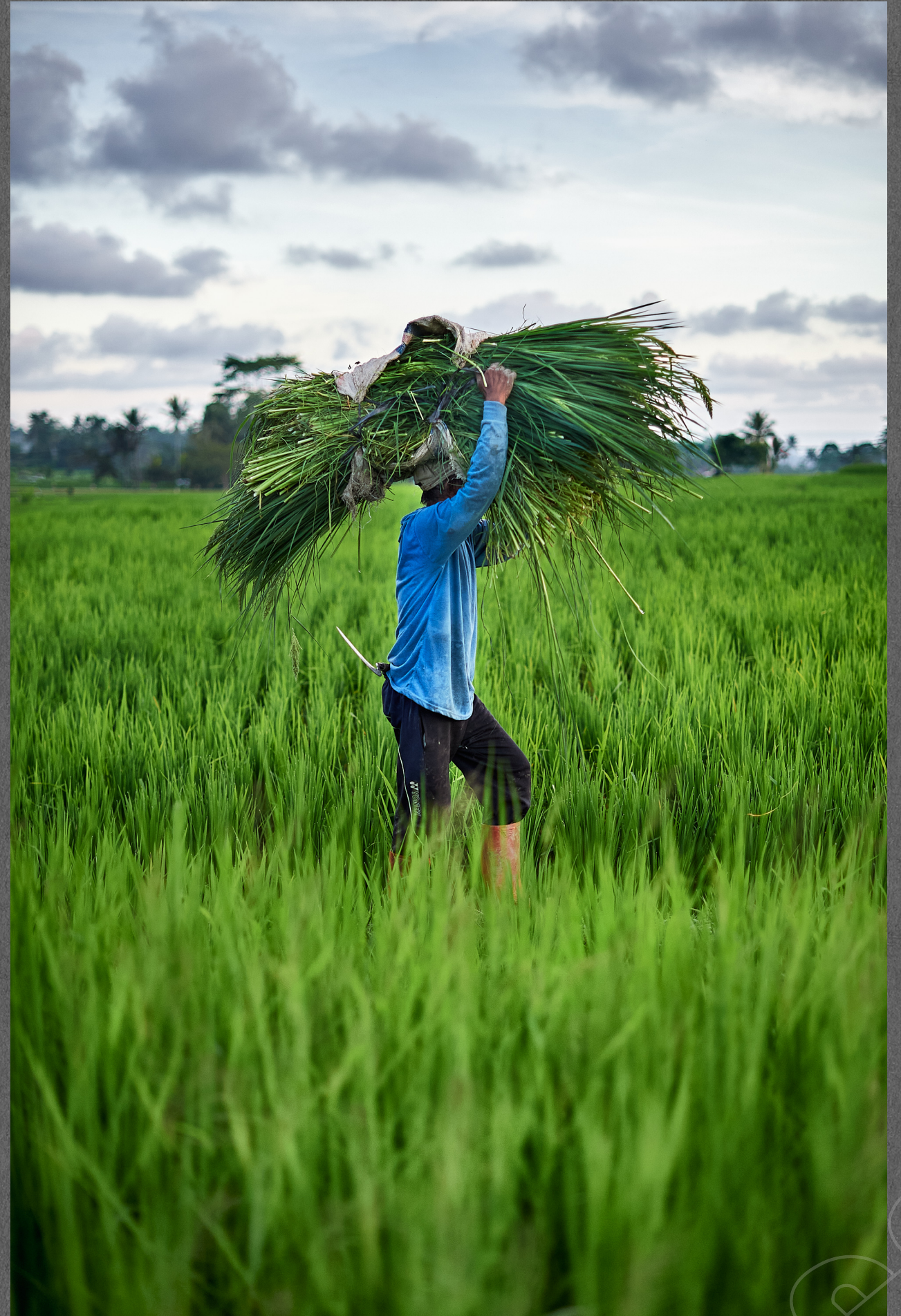
Above : Farming community in the fields of Ubud