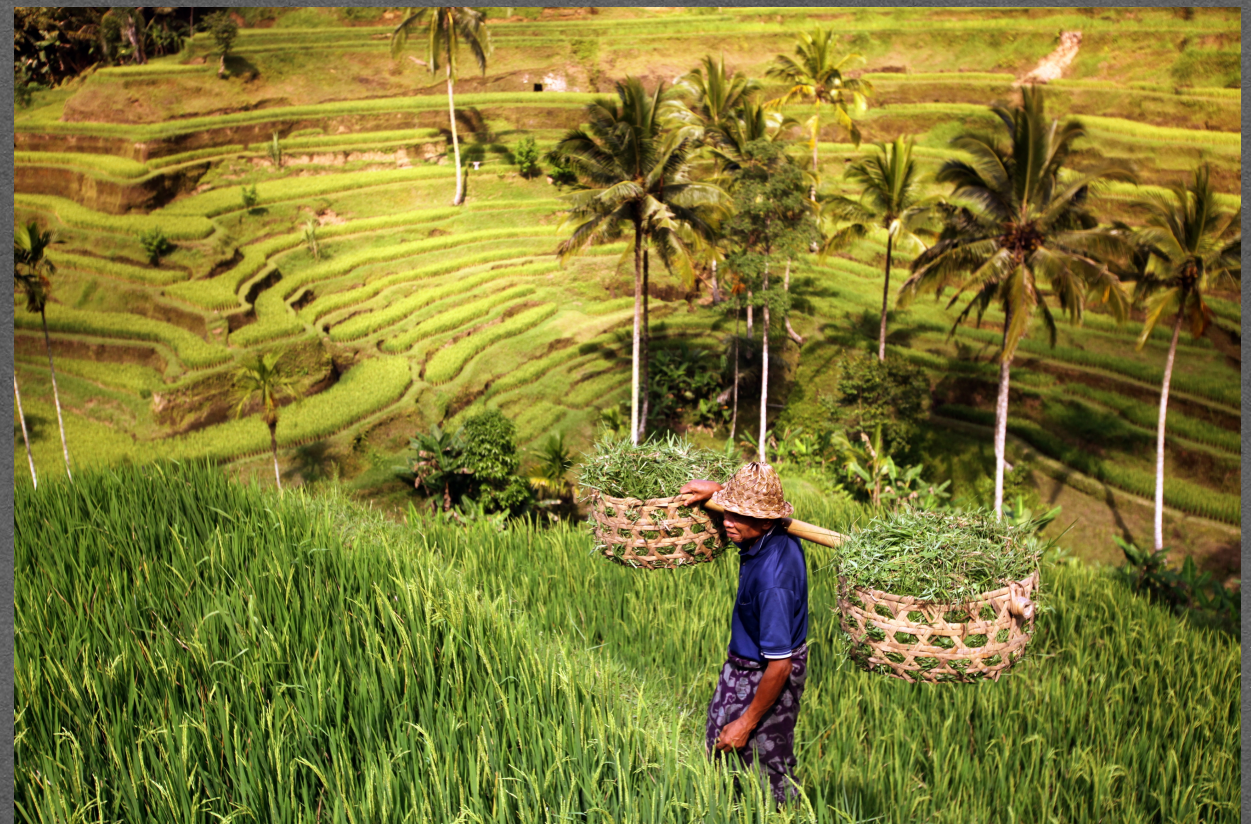
Above left : Suwat Waterfall Above right : Purification ritual @ Tirta Empul Below : Tegallalang rice terraces

Click to hear your Travel Designer discuss the merits and attractions of this program.