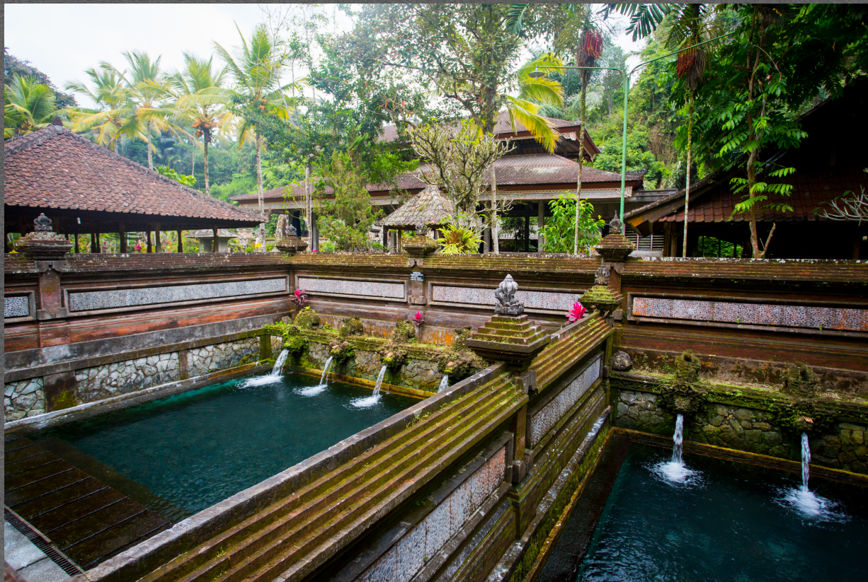
Above left : Water Purification Ceremony Above right : Healing at Pyramids of Chi Below: Subatu Temple

Click to hear your Travel Designer discuss the merits and attractions of this program.