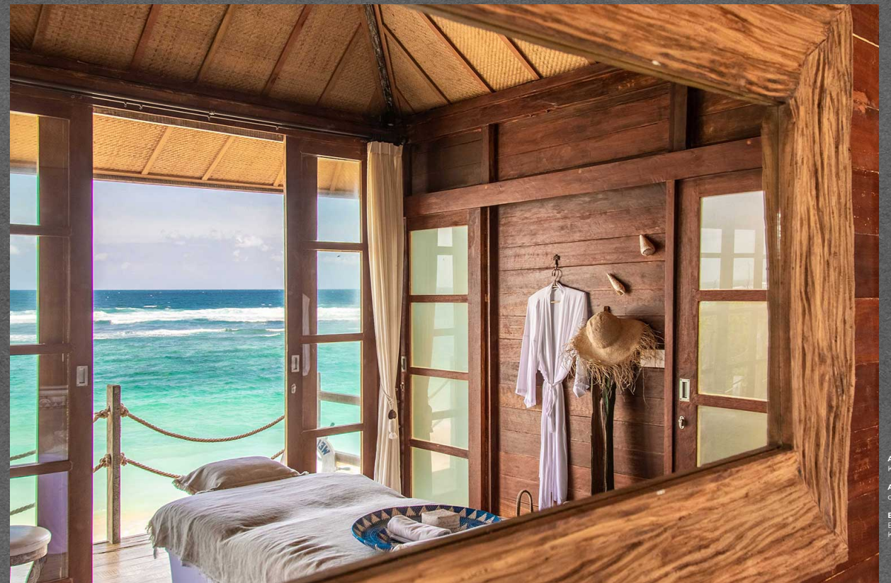
Above left : VW Kublewagon