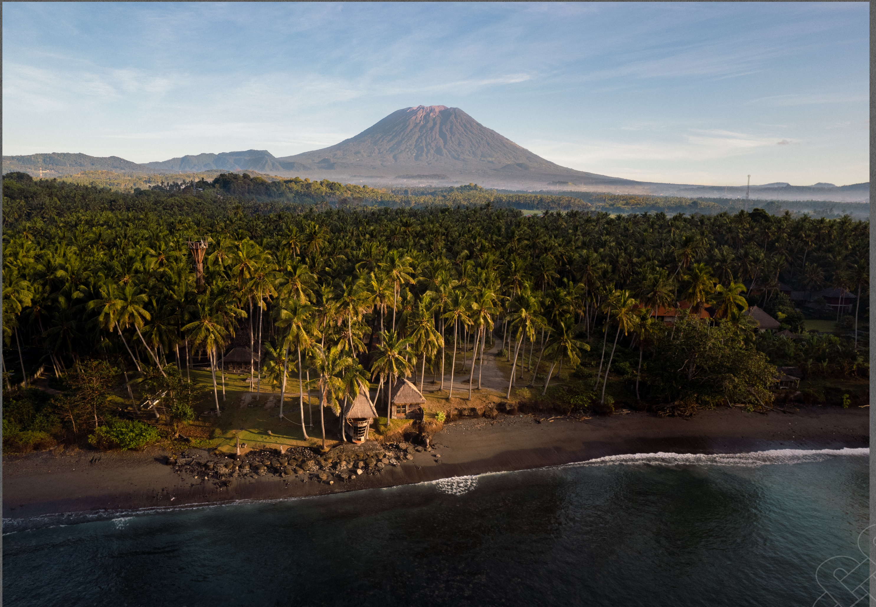
Above : The view of Gunung Agung from Pekutatan, West Bali