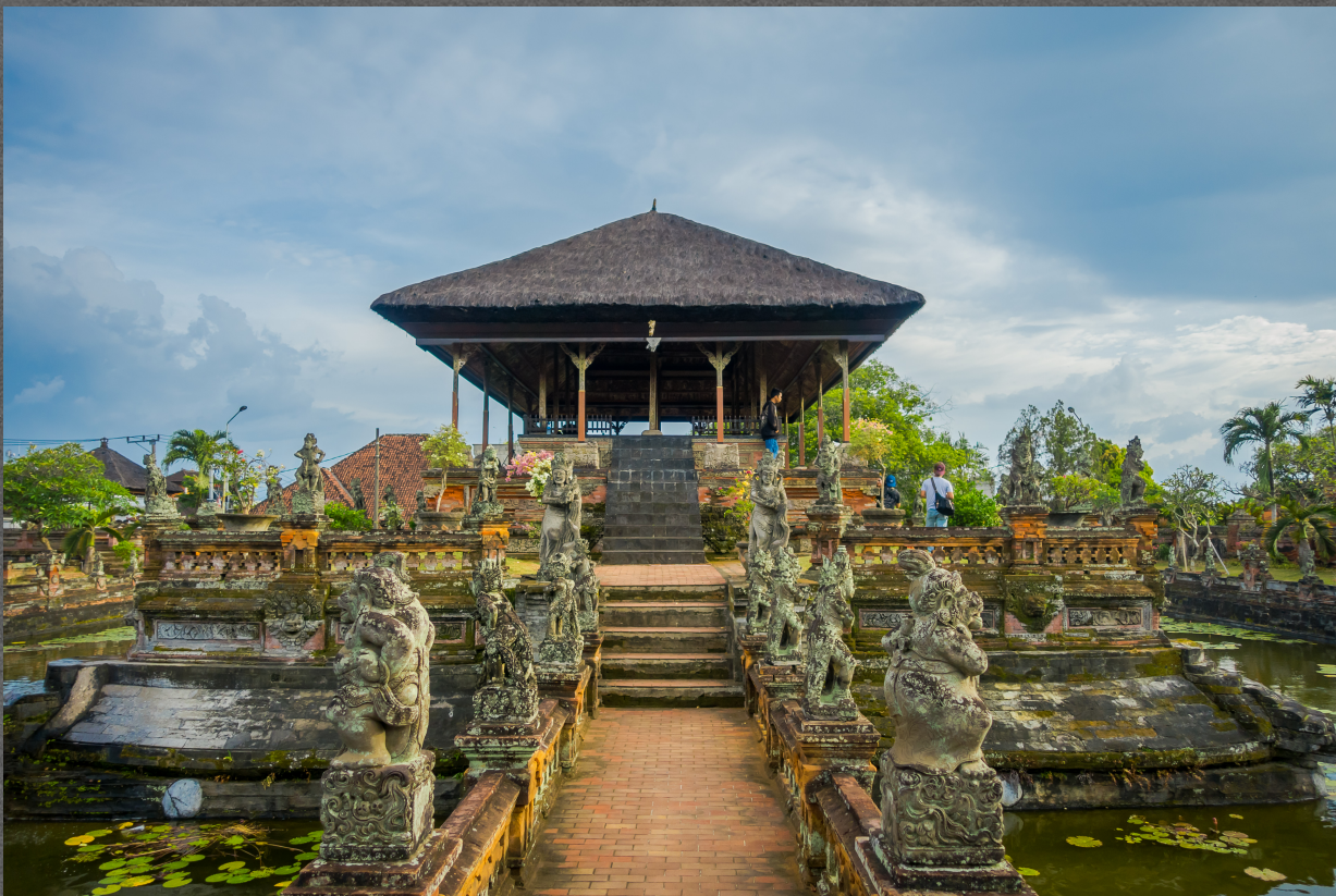
Above left : East Bali Countryside