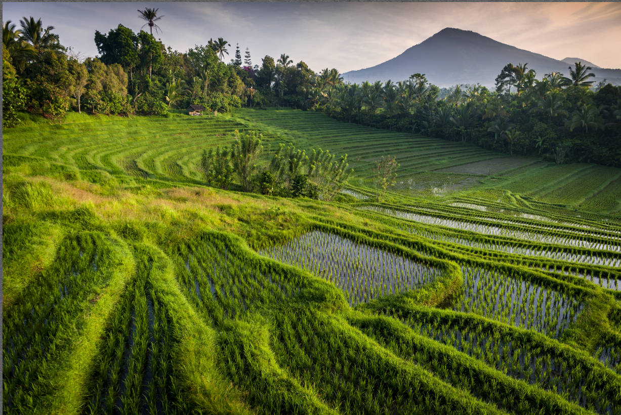
Top Left: Cycling along Bali country paths