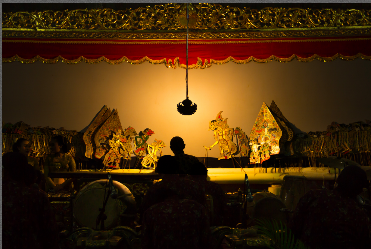
Above left : Wayang Character Above right : Wayang performance at night Below: The shadow puppet master behind the scenes

Click to hear your Travel Designer discuss the merits and attractions of this program.