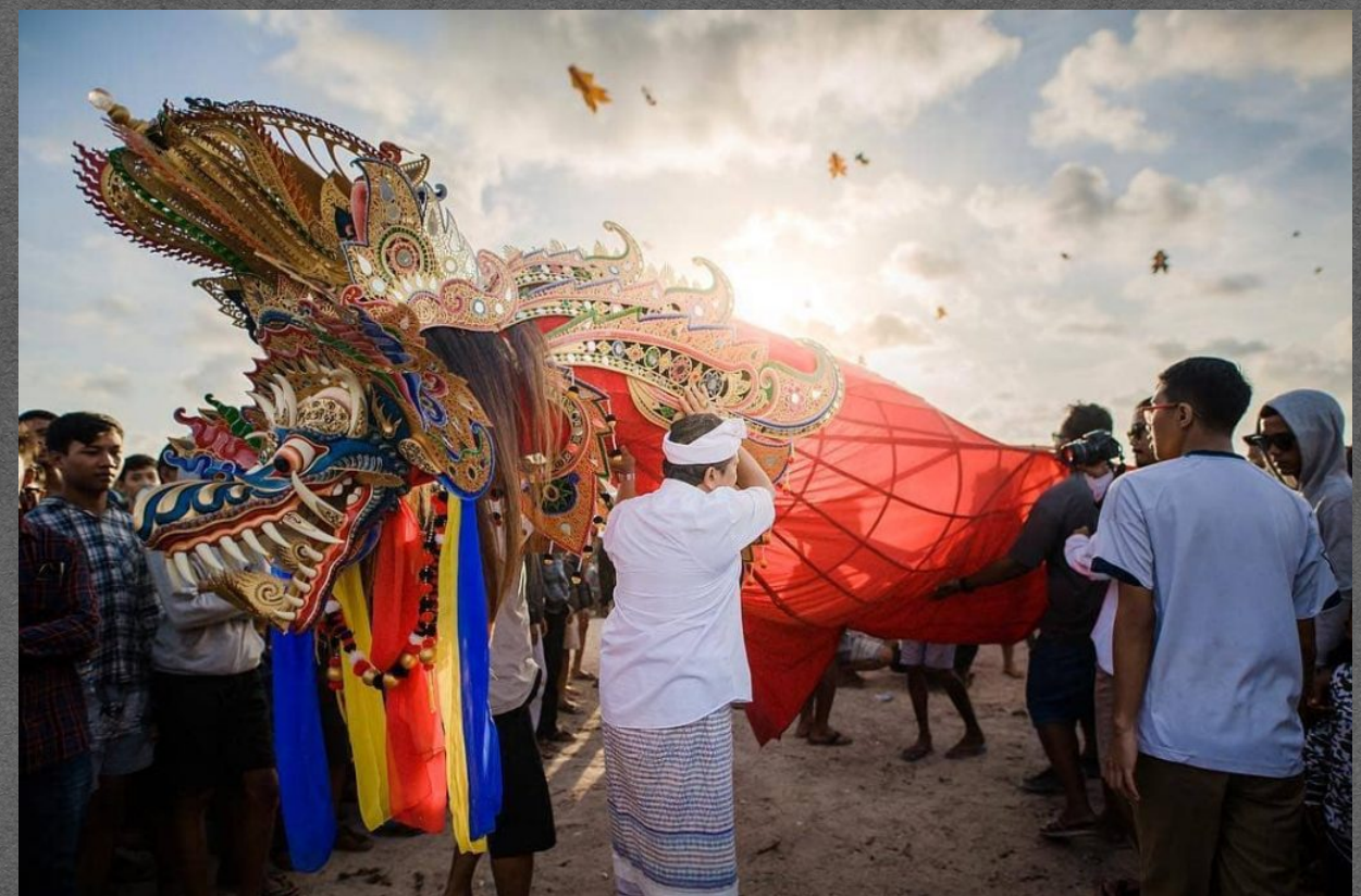
Above Left: Balinese kites Above Right: Kite flying during competition Below : Kite flying competition

Click to hear your Travel Designer discuss the merits and attractions of this program.