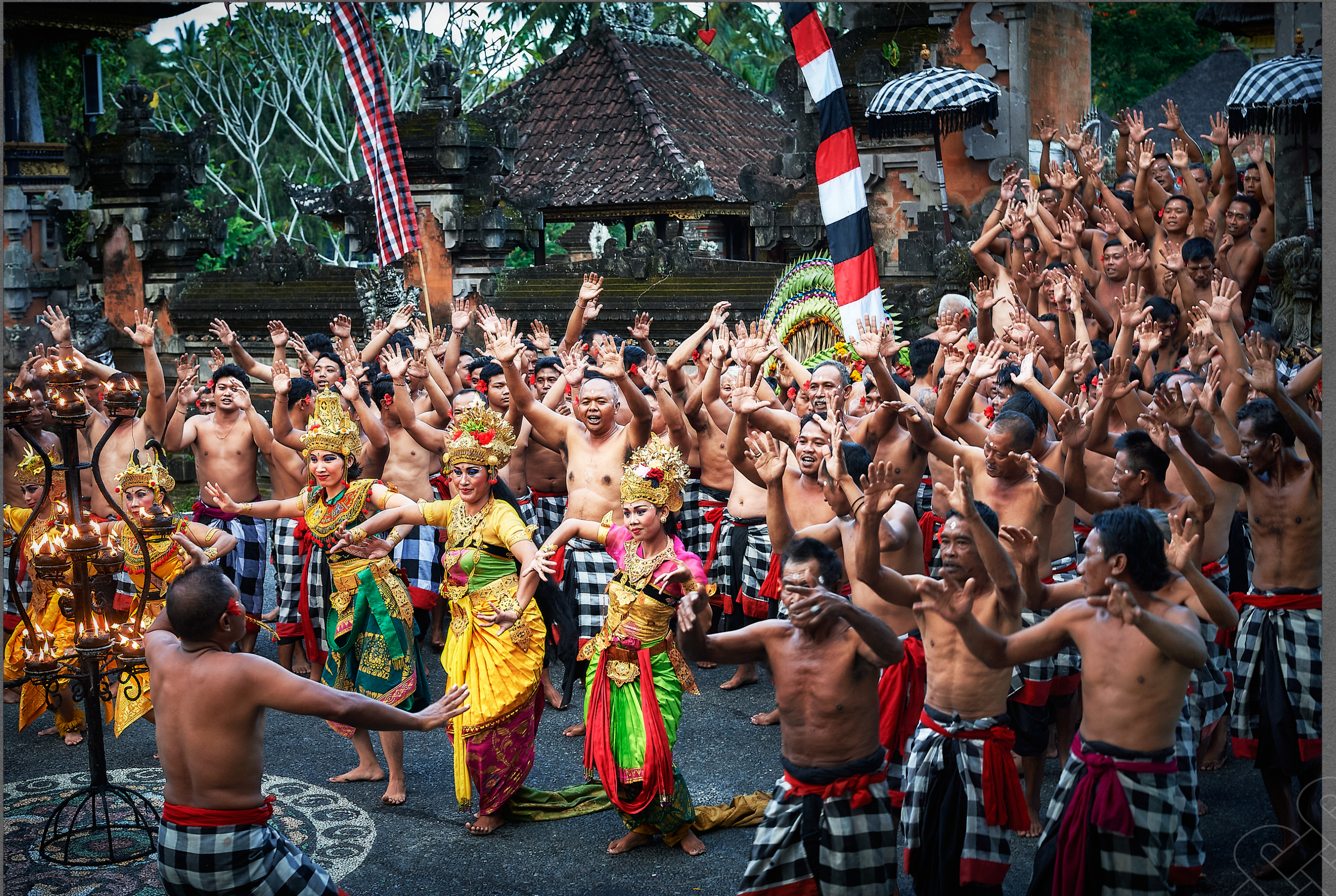
Above : A private Kecak dance performance at a village temple