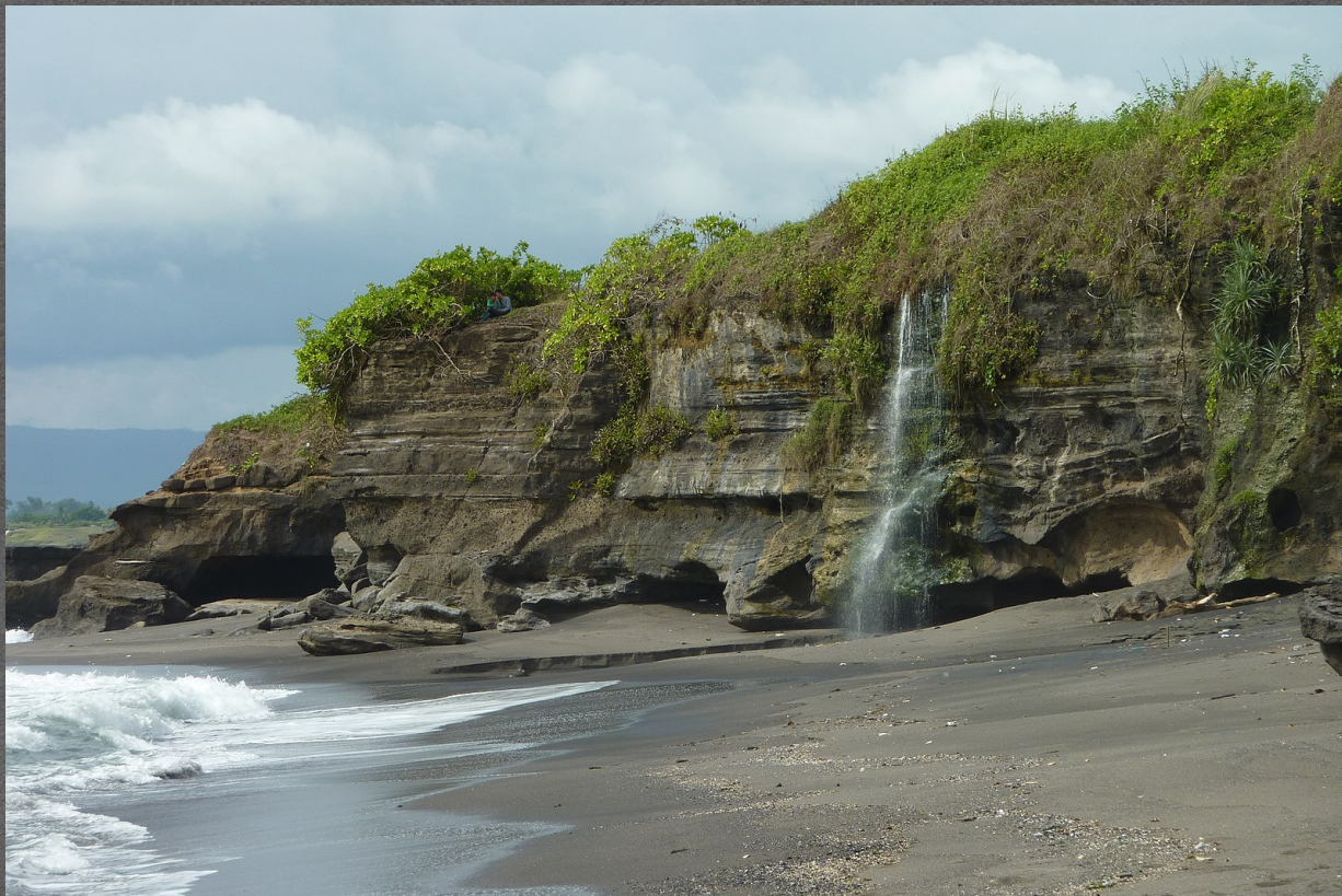
Above: Puri Tanah Lot Below: Waterfall at Melasti Beach, Tabanan

Click to hear your Travel Designer discuss the merits and attractions of this program.