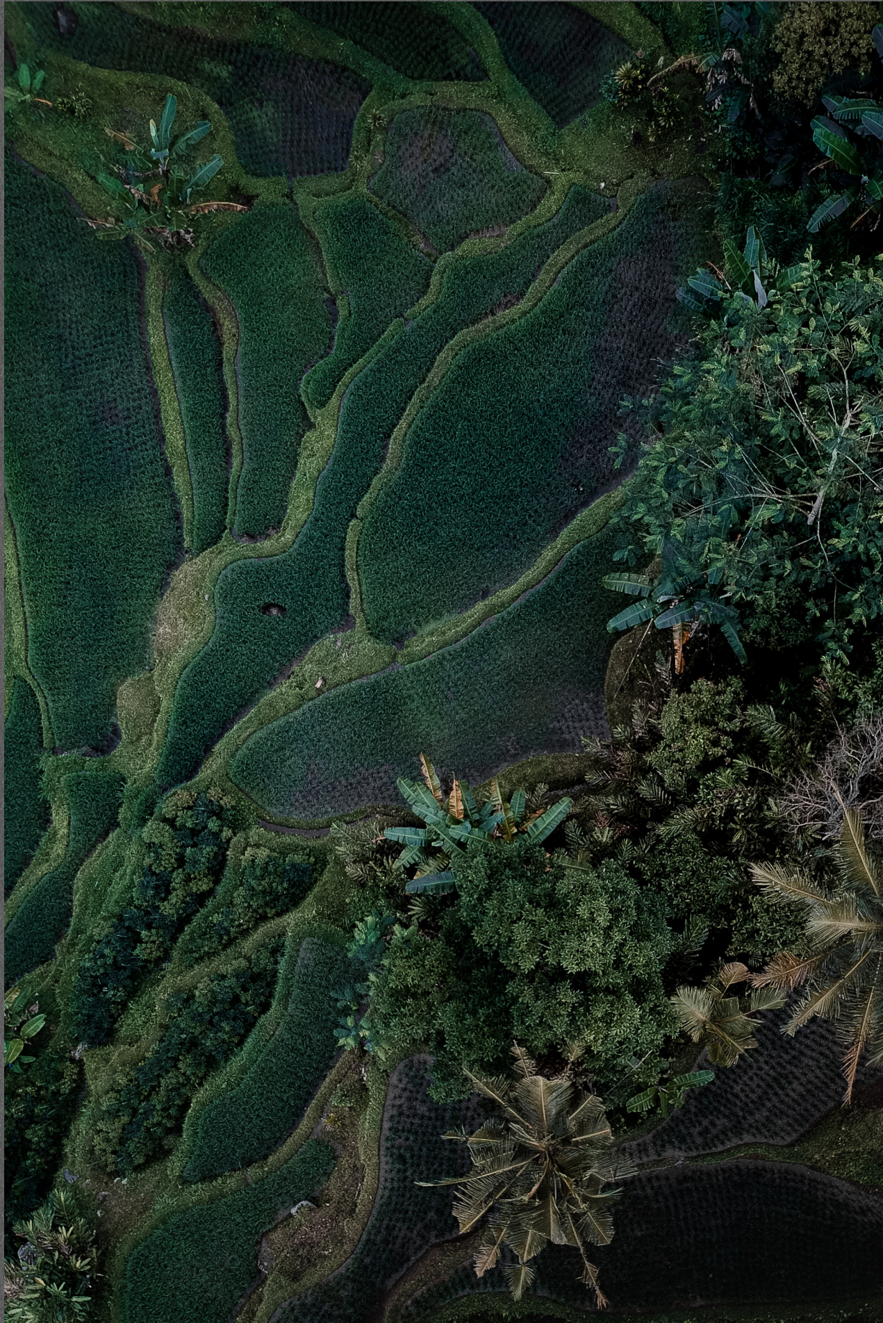
Above : Bali rice terraces from above