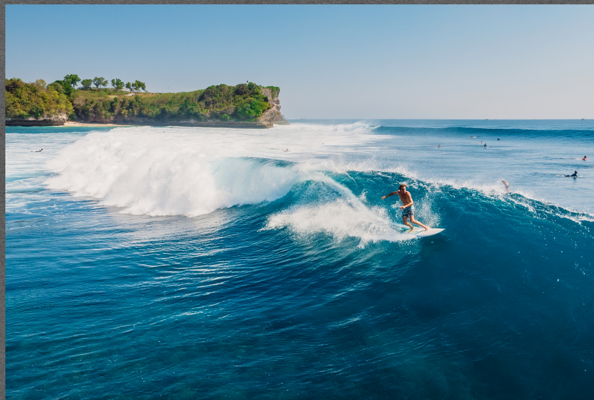
Above left : Sanding process of shaping a surfboard