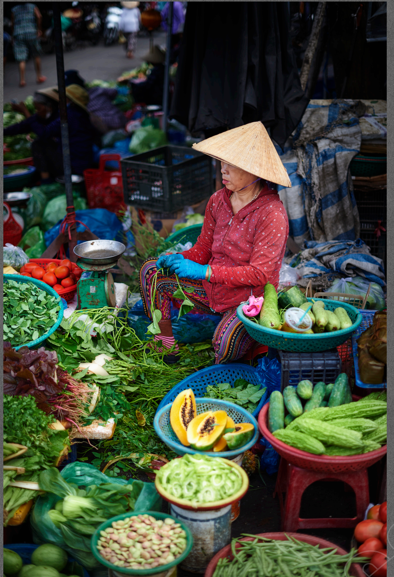
Above : Hoi An's morning market