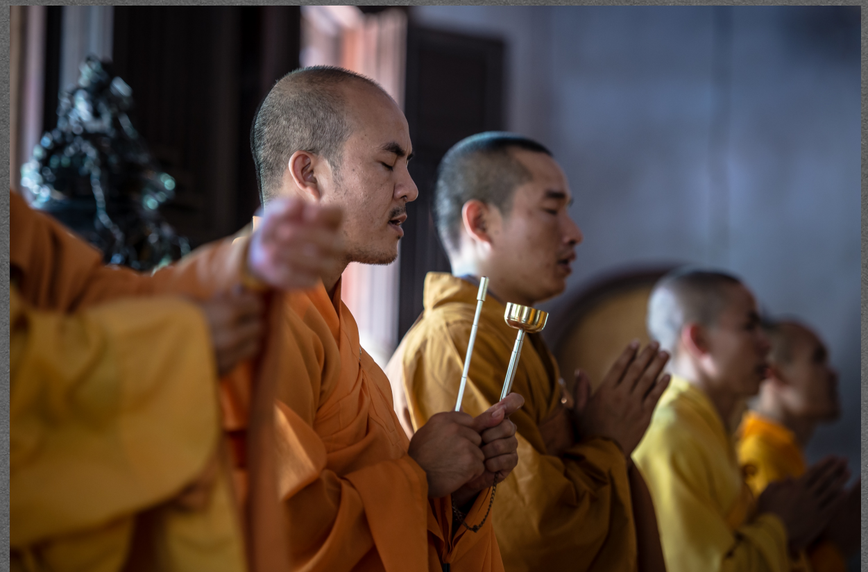
Above left : The Perfume River