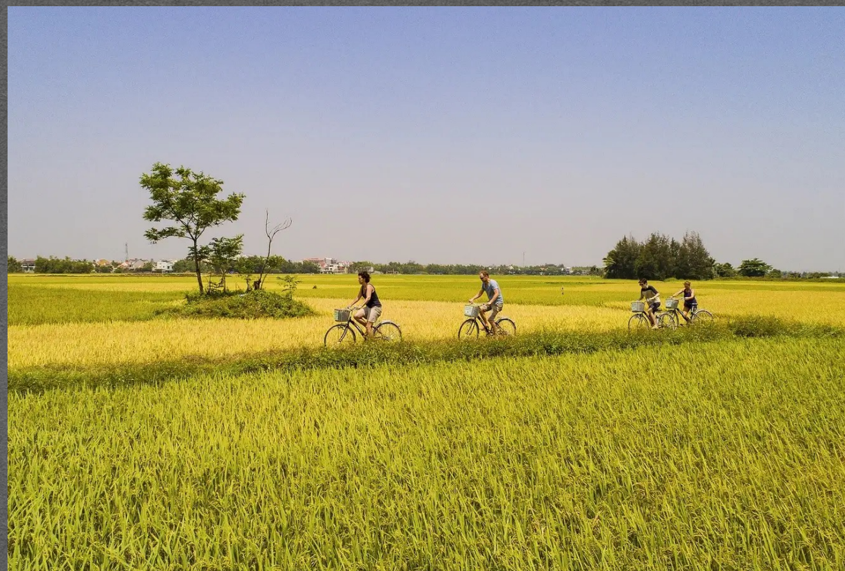
Above left : Ba Le Market