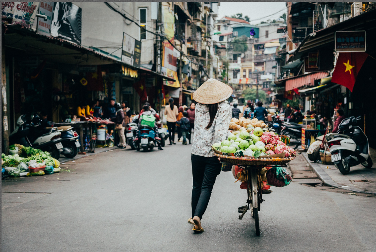
Above left : Vinh Phuc street market