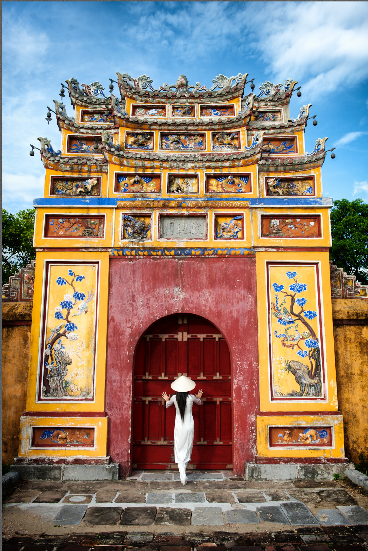
Above : Entering the gates of Hue Citadel