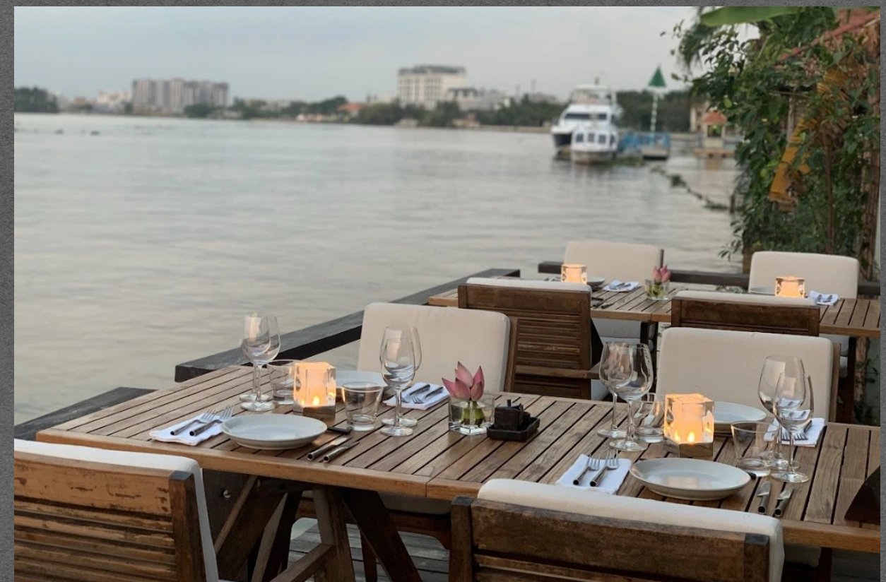
Above left : Laang Restaurant