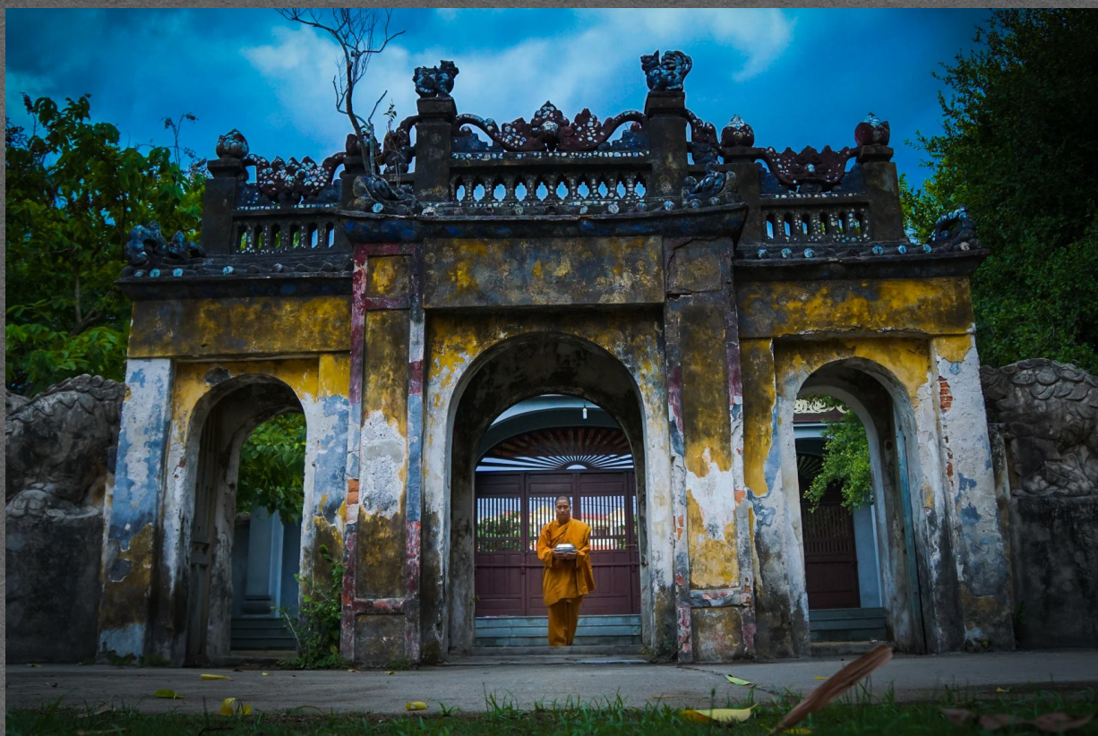
Above left : Vespa transportation