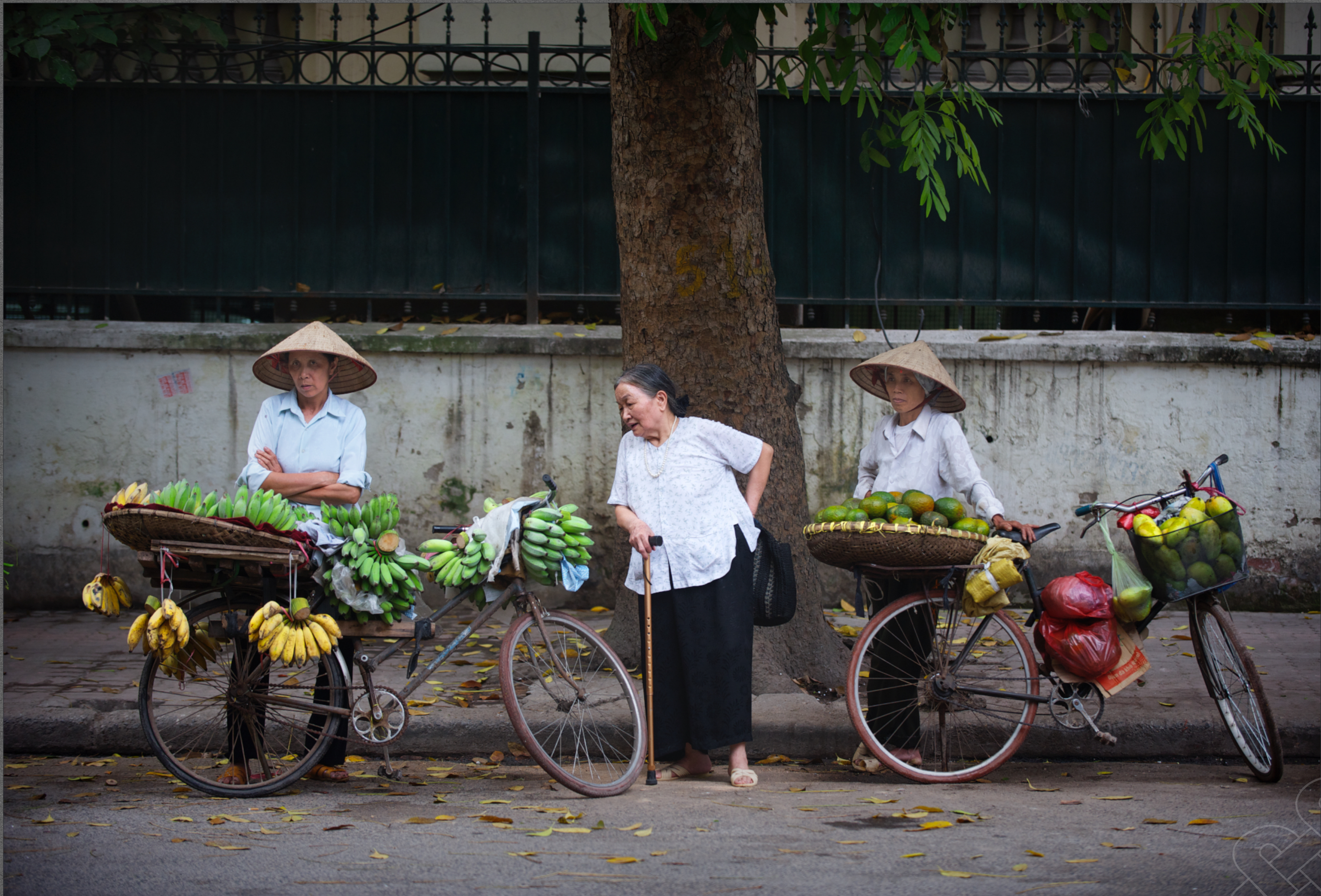
Above: Hanoi street scene