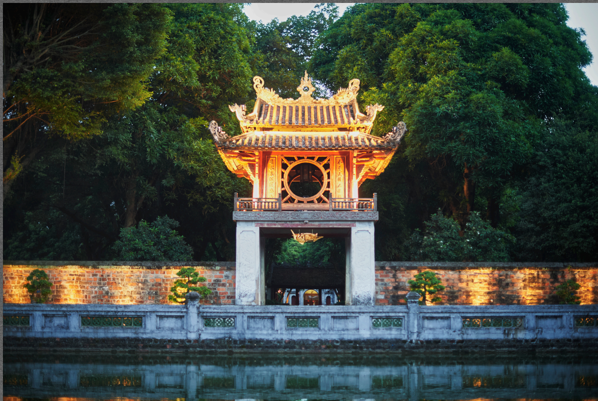
Above left : Entering the main courtyard at dusk