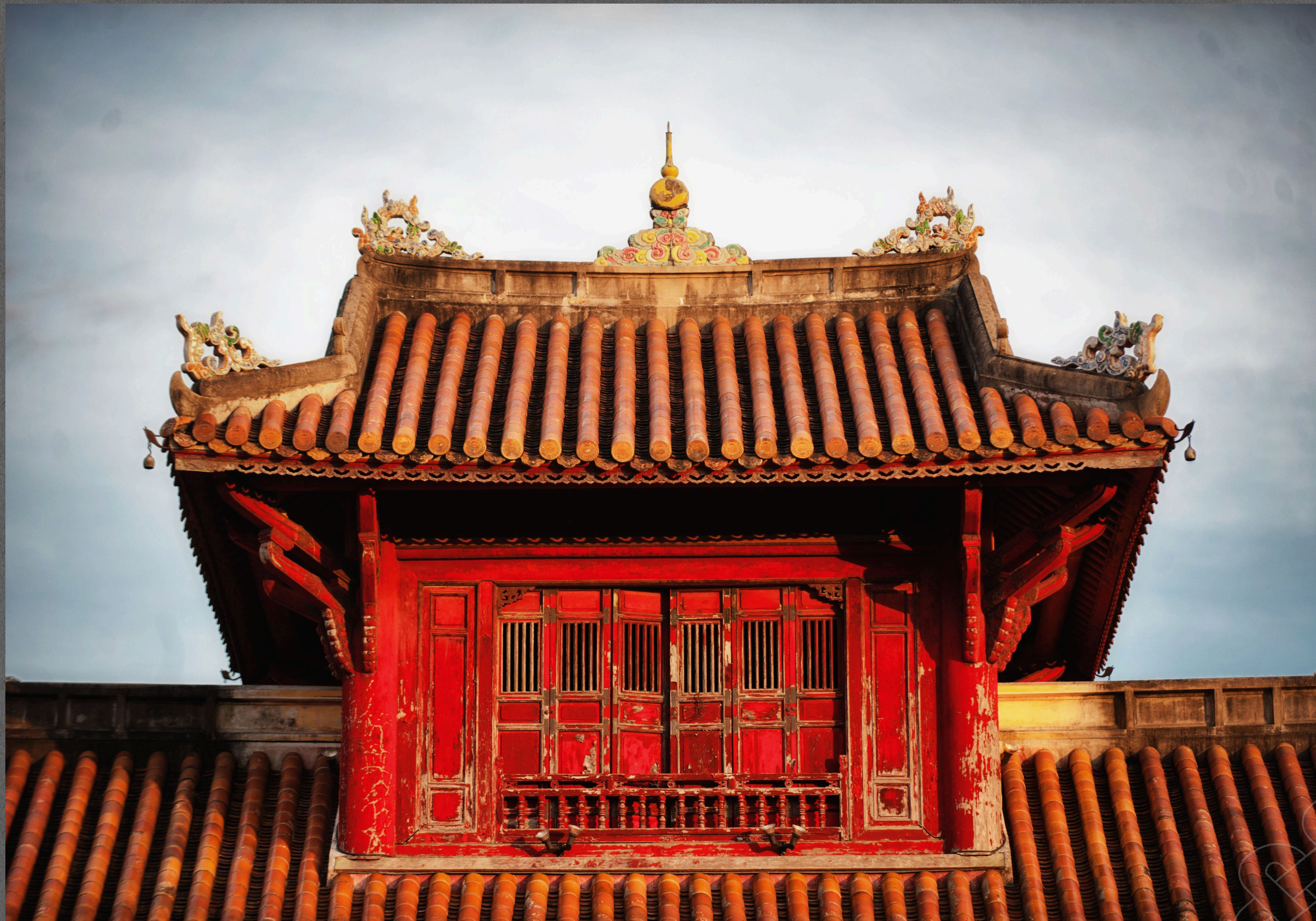
Above : The Architecture of Hue Citadel.